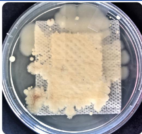
* Microbiological contamination of Commercially available tapes

Study comparing the microbiological contamination of commercially available medical tapes versus TRIOMED™ tape after only 1 hour on a patient.